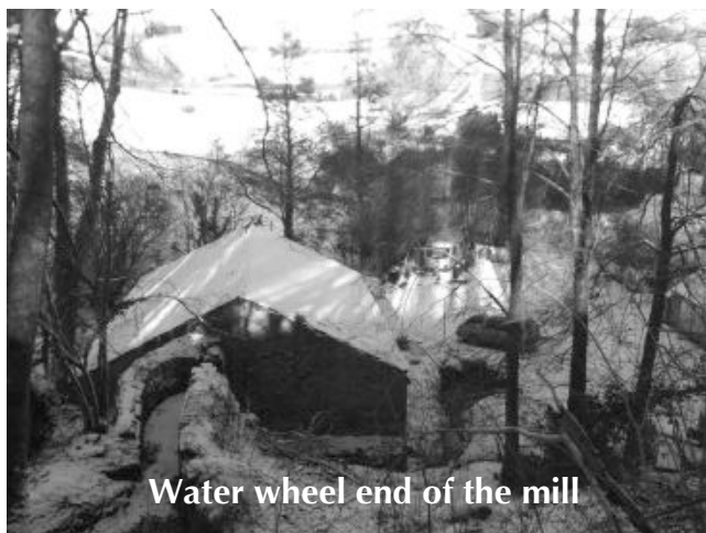
Water wheel end of the mill