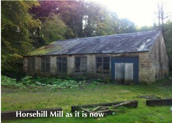
Horsehill Mill as it is now