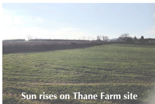
Sun rises on Thane Farm site

Two of these ticked most of the boxes for our advisers but in the end the Thane Farm site found favour and was chosen by the committee as their recommended option.