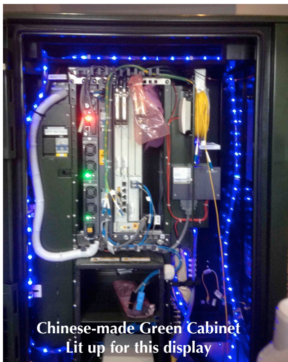
Chinese-made Green Cabinet Lit up for this display

He introduced a Chinese-built green cabinet that will be installed next to the present BT generation of distribution green cabinets with their welter of copper cables connecting to individual homes and businesses. At £10,000 each these are the key to getting high speed and high volume of broadband traffic from the exchanges and into the villages.