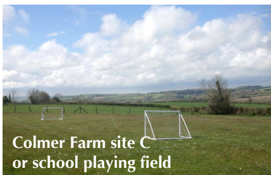
Colmer Farm site C or school playing field

At this meeting the committee expects to present their efforts in forming the CLT and progressing the project as swiftly as possible to take full advantage of possible sources of finance.