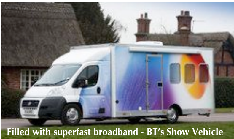
Filled with superfast broadband - BT's Show Vehicle

H ow broadband might work for residents of our villages as well as how we may be wired up by fibre optic cables was made clear to residents who braved the wind, rain and sunny spells to see BT's brand new demonstrator van which parked next to Bettiscombe village hall last month. After engine problems on the previous day, thanks to the AA the van arrived from Bridport and opened its doors to visitors.